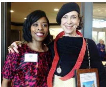
Selling Raffle Tickets for a Fantastic Vacation