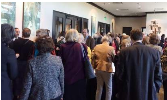
Excited Crowd at the Silent Auction