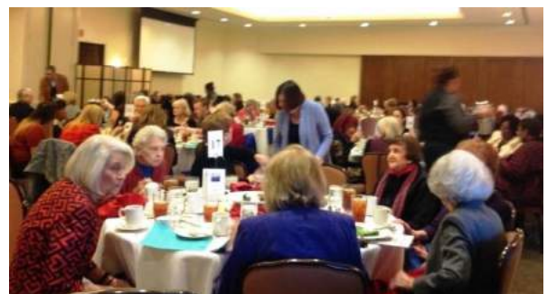
Getting to Know You...