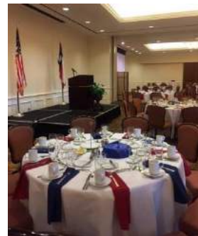
Susan B. Anthony Luncheon Table & Stage