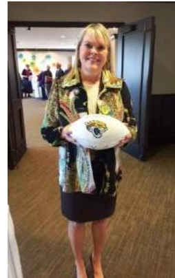
Silent Auction Winner of Football & Jersey