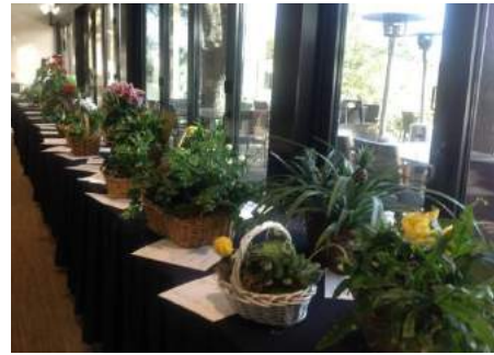
Beautiful Flower Baskets at the Silent Auction