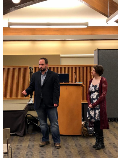
Speakers at the Oil and Water Don't Mix program speak about environmental concerns relating to Line 5