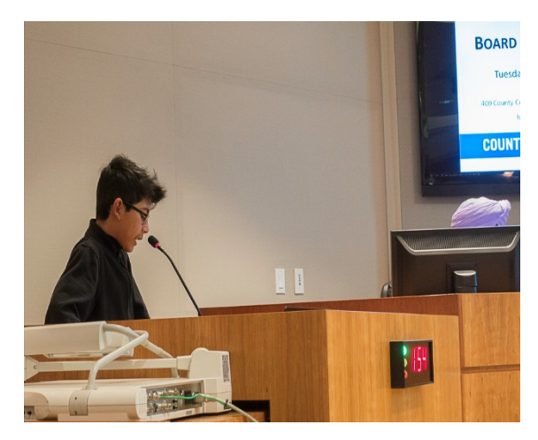
Speaking to the San Mateo County Board of Supervisors

relocated to Richmond. The student is living with her aunt in Redwood City so that she can graduate from high school in June.)