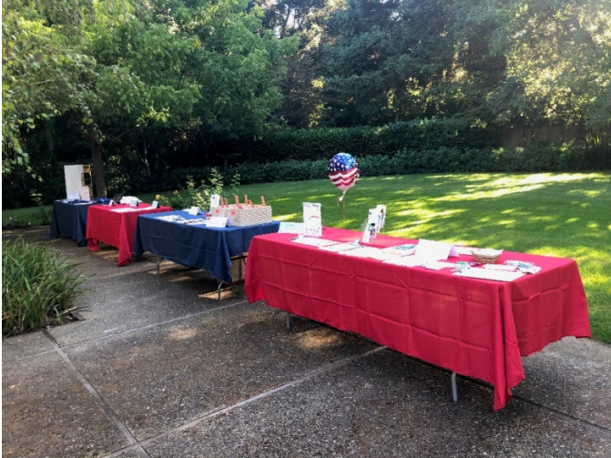
Information display—showing off our new tablecloths!