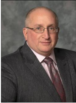
Bob Crimo Highland Park Mayor

WRITE A BRIEF BIOGRAPHY THAT INCLUDES YOUR QUALIFICATIONS FOR THIS OFFICE.