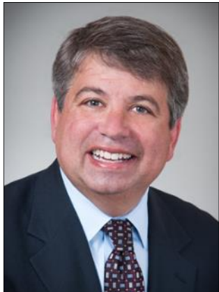
Cal Bernstein Park District

WRITE A BRIEF BIOGRAPHY THAT INCLUDES YOUR QUALIFICATIONS FOR THIS OFFICE.