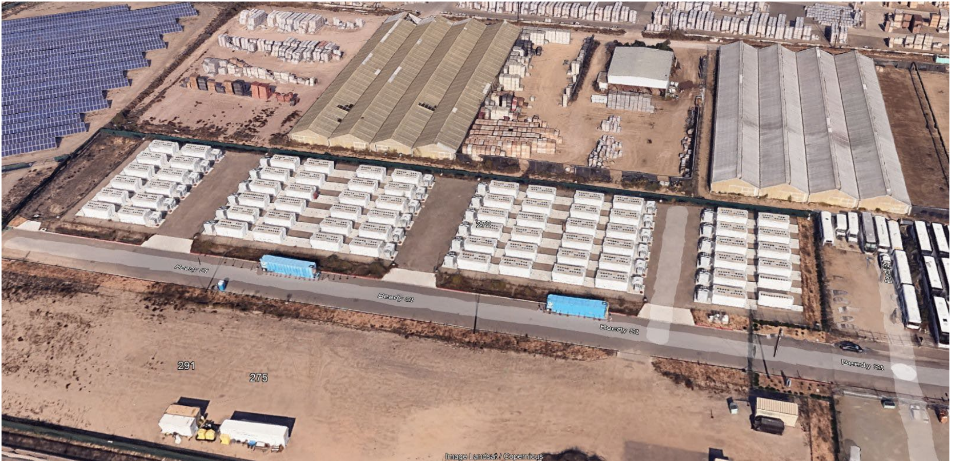
Oxnard Battery Storage Facility Beedy St just west of E. Vineyard Ave