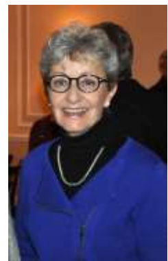
Picture from a 2014 Winter Doldrums Event